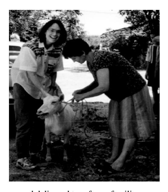
...and delivered to refugee families.